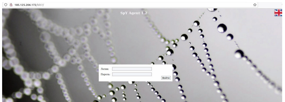
Figure 6: SpyAgent C2 panel

During our investigation, the C&C was still working, allowing us to confirm that the malware bundled with "Safib Assistant" is indeed "SpyAgent:"