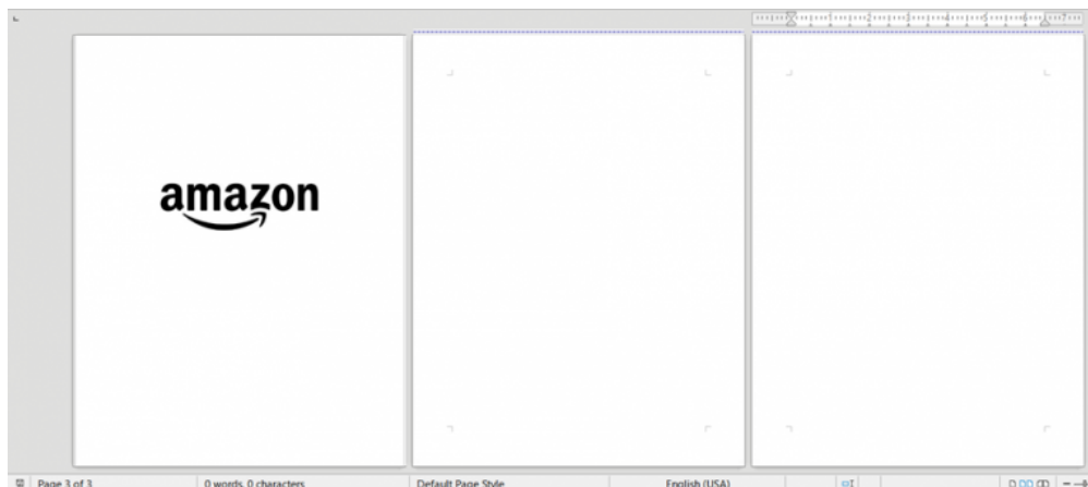
Figure 1. Amazon-themed document sent to the target in the Netherlands

In the Netherlands, the attack affected a Windows 10 computer connected to the corporate network, where an employee was contacted via LinkedIn Messaging about a supposed potential new job, resulting in an email with a document attachment being sent. We contacted the security practitioner of the affected company, who was able to share the malicious document with us. The Word file Amzon_Netherlands.docx sent to the target is merely an outline document with an Amazon logo (see Figure 1). When opened, the remote template https://thetalkingcanvas[.]com/thetalking/globalcareers/us/5/careers/jobinfo.php?image=<var>_DO.PROJ (where <var> is a seven-digit number) is fetched. We were unable to acquire the content, but we assume that it may have contained a job offer for the Amazon space program, Project Kuiper . This is a method that Lazarus practiced in the Operation In(ter)ception and Operation DreamJob campaigns targeting aerospace and defense industries.