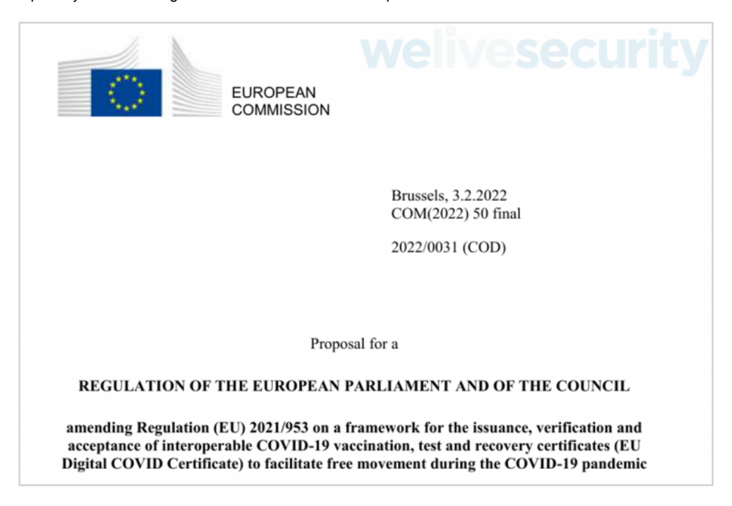
Figure 3. First page of the decoy document for the REGULATION OF THE EUROPEAN PARLIAMENT AND OF THE COUNCIL.exe downloader. It's a real document available on the European Council's website.

To further the illusion, these binaries download and open a document that has the same name but with a .doc or .pdf extension. The contents of these decoys accurately reflect the filename. As shown in Figure 3, at least one of them is a publicly accessible legitimate document from the European Parliament.