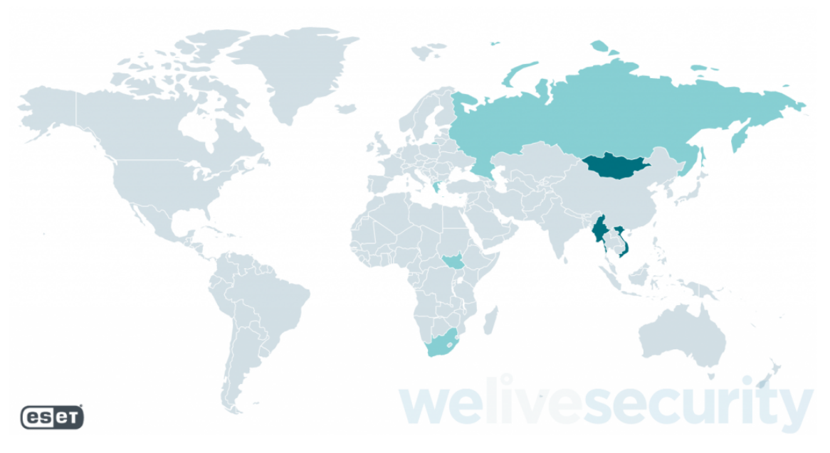
Figure 1. Countries affected by Mustang Panda in this campaign